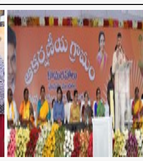
VIJAYAWADA, JAN 27 (UNI) Pradesh Chief Minister N Chan addressing during participate v development programme at Ko